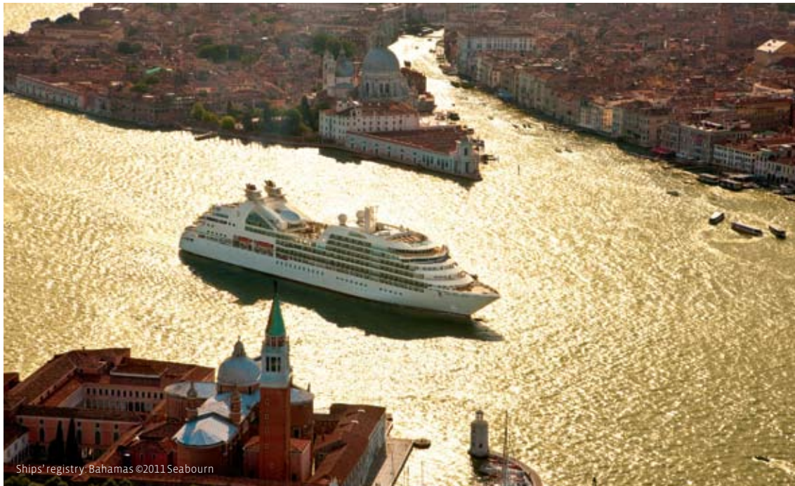
Ships' registry: Bahamas

THE WORLD IS YOURS – AND THE SHIP CAN BE TOO.