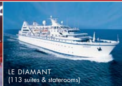
LE DIAMANT (113 suites & staterooms)

Incentives, seminars, events, meetings, team-building activities or product launches... Charter or book a group on one of our elegant ships.