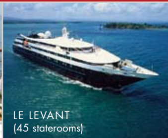
LE LEVANT (45 staterooms)