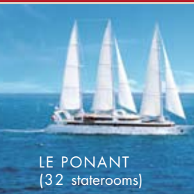
LE PONANT (32 staterooms)

CREATE SYNERGY • BE ENERGIZED • EXCHANGE IDEAS • SHARE KNOWLEDGE