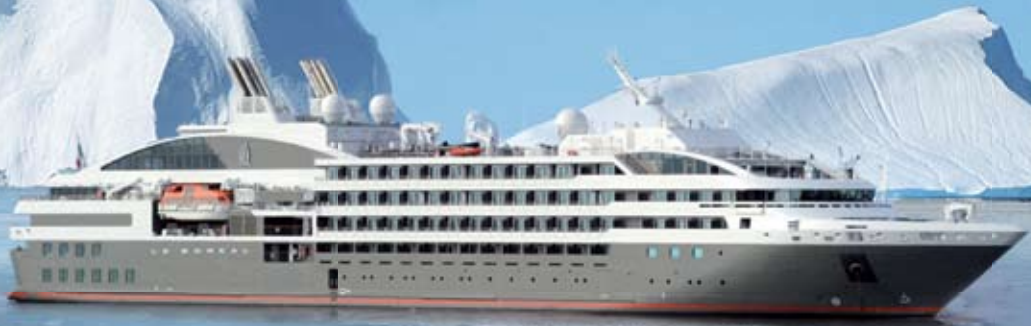
LE BORÉAL & L'AUSTRAL (132 suites & staterooms)